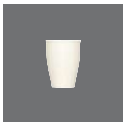
Teesieablage , Bowl for teastrainer, Support pour filtre, Bowl para colador de sintético de te, Tazza per filtro