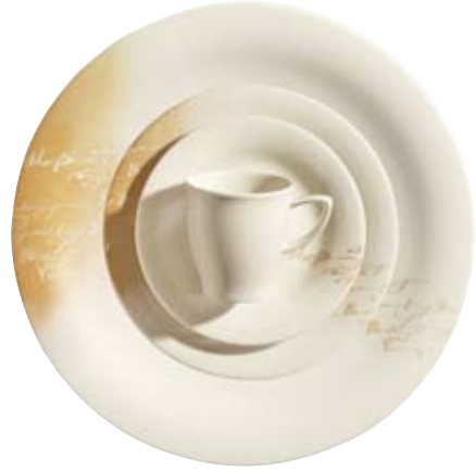
418440 Poème Hohlteile undekoriert, Hollowware undecorated, Articles creux sans décor, Piezas complementarias sin decorar, Articoli cavi senza decoro