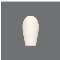
Tischvase , Flower vase, Vase à fleurs, Florera, Vaso per fiori