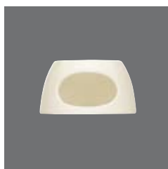
Stövchen , Plate warmer, Réchaud, Calentador, Scaldateiera