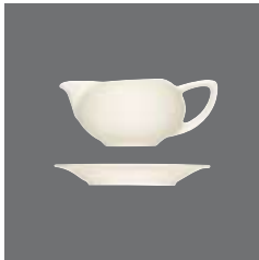
Sauciere , Sauce-boat, Saucière, Salsera, Salsiera