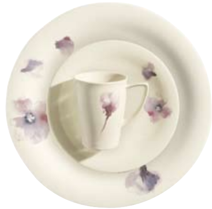
418450 Fleury Violet