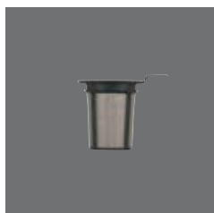
Teesieb Kunststoff , Teastrainer plastic, Filtre plastique à thé avec anse mobil, Colador de sintético de te, Filtro in plastica