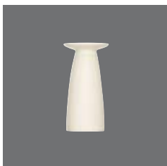
Leuchter , Candleholder, Bougeoir, Candelabro, Candeliere