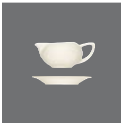
Saucenschälchen , Sauce-boat small, Saucière petite, Salsera pequeña, Salsiera