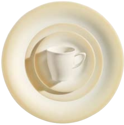
418460 Bellevue Hohlteile undekoriert, Hollowware undecorated, Articles creux sans décor, Piezas complementarias sin decorar, Articoli cavi senza decoro