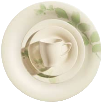
418480 Fleury Grün Hohlteile undekoriert, Hollowware undecorated, Articles creux sans décor, Piezas complementarias sin decorar, Articoli cavi senza decoro