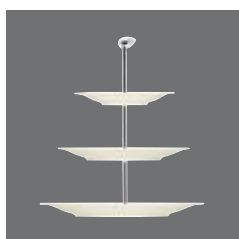
Etagere , Etagère, Etagère, Etagère, Etagere