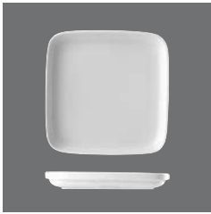
Teller flach quadratisch , Plate flat square, Assiette plate carrée, Plato llano cuadrado, Piatto piano quadrato