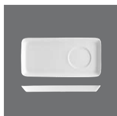
Setplatte breit , Setplatter wide, Plat rectangulaire, Fuente rectangular, Vassoio per tazza