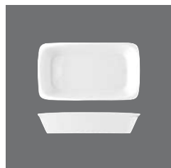
Schale rechteckig , Dish rectangular, Ravier rectangulaire, Bowl rectangular, Coppa rettangolare