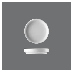
Schale , Sugar tray, Assiette à sucre, Platillo azúcar, Coppetta