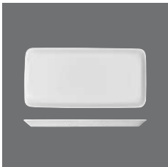
Platte rechteckig , Platter rectangular, Plat rectangular, Fuente rectangular, Piatto quadrato