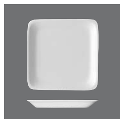
Teller flach quadratisch , Plate flat square, Assiette plate carrée, Plato llano cuadrado, Piatto piano quadrato