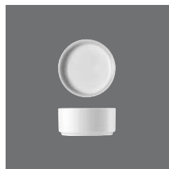
Schale , Butter dish, Beurrier, Plato mermelada, Porta burro