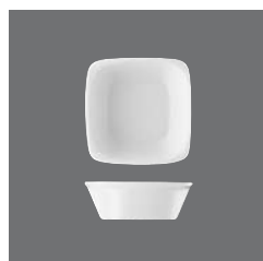
Salatiere quadratisch , Salad dish square, Saladier carrée, Ensaladera cuadrada, Insalatiera quadrata