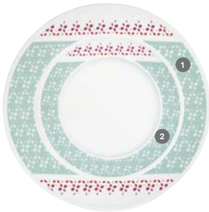
1 421291 Camille 1 2 421293 Camille 3 Nur erhältlich auf Teller.; Only available on plates; Uniquement disponible sur les assiettes; Solo en los platos.; Solo disponibile su piatti:

1 28 1826, 28 1829, 28 1831 2 28 1816, 28 1823