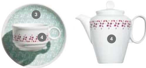
3 421295 Camille 5 4 421292 Camille 2 Nur erhältlich auf Untere.; Only available on saucers; Uniquement disponible sur les soucoupes; Solo en los platitos.; Solo disponibile su piattini;

Nur erhältlich auf Teller.; Only available on plates; Uniquement disponible sur les assiettes; Solo en los platos.; Solo disponibile su piatti: 28 1916, 28 1925, 28 1929, 28 1922