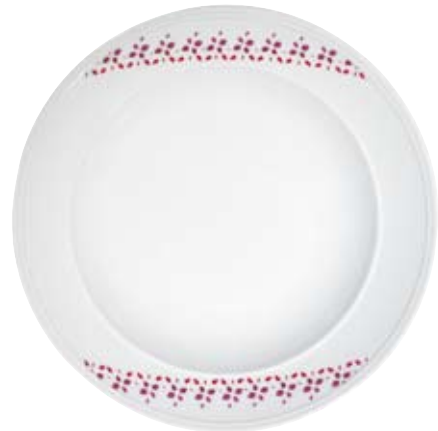
421294 Camille 4

1 28 1826, 28 1829, 28 1831 2 28 1816, 28 1823