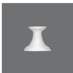
Leuchter , Candleholder, Bougeoir, Candelabro, Candeliere

> Tischvase bauchig 19 8100 5372 - 78 (3.07) 126 200