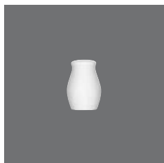
Pfefferstreuer , Pepper shaker, Poivrière, Pimentero, Spargi pepe

> Salzstreuer 55 4010 5528 - 47 (1.85) 69 60