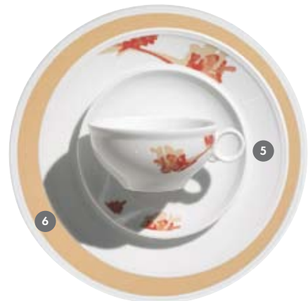
5 421312 Lauraine* 6 421311 Lauraine Fahnenfond

6 Auf Teller flach + tief steile Fahne, Untere.; All plates flat + deep steep rim, saucer.; Aile décorée: toutes les assiettes plates et creuses, soucoupes.; En platos y ala inclinadas, platitos.; Tutti i piatti piani e fondi con falda alta, piattini: 28 6918, 28 6935