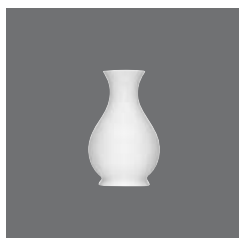
Tischvase , Flower vase, Vase à fleurs, Florero, Vaso per fiori

> Pfefferstreuer 55 4020 5529 - 47 (1.85) 69 60