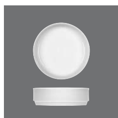
Eintopfschale , Stew bowl, Bol à plat unique, Ensaladera redonda, Insalatiera rotonda