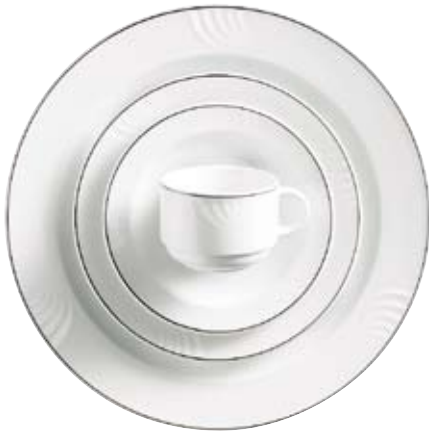
800144 Farblinie Schwarz