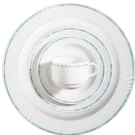
409070 Laguna Lagerdekor, Stock decoration, Décoration de stock, Decorado de stock, Decoro su articoli in magazzino