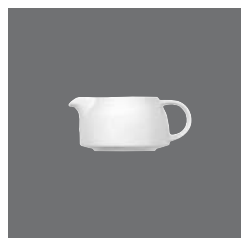
Sauciere , Sauce-boat, Saucière, Salsera, Salsiera

> Suppenschale 25 6512 2558/12 0,38 (12.85) 119 (4.69) 52 / 383 310