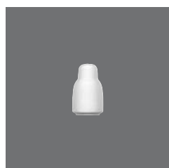
Pfefferstreuer , Pepper shaker, Poivrière, Pimentero, Spargi pepe

> Salzstreuer 25 4011 2528 - 53 (2.09) 89 105