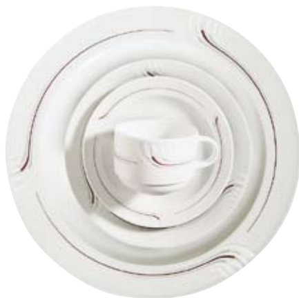
405750 Baccara Lagerdekor, Stock decoration, Décoration de stock, Decorado de stock, Decoro su articoli in magazzino