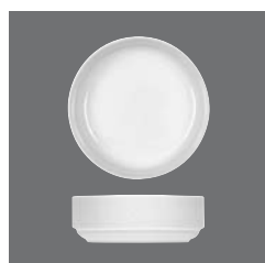
Salatiere rund , Salad dish round, Saladier rond, Ensaladera redonda, Insalatiera rotonda