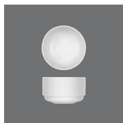
Bowl rund , Bowl round, Bol rond, Bowl redondo, Coppetta rotonda

> Bowl rund 0.27 25 6510 2558/0.27 0,27 (9.13) 95 (3.74) 56 / 456 195