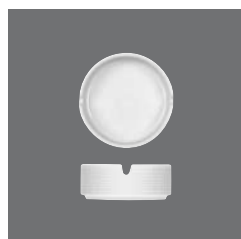
Ascher , Ashtray, Cendrier, Cenicero, Posacenere

> Tischvase 25 8100 2590 - 74 (2.91) 124 175