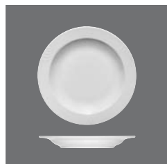
Teller halbtief Fahne , Plate half-deep with rim, Assiette demi-creuse à l'aile, Plato medio hondo con ala, Piatto semifondo