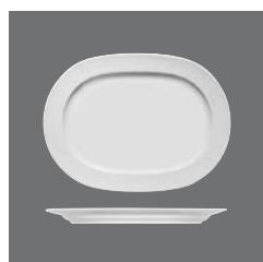
Platte oval Fahne , Platter oval with rim, Plat ovale à l'aile, Fuente oval con ala, Piatto ovale