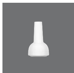
Tischvase , Flower vase, Vase à fleurs, Florero, Vaso per fiori

> Pfefferstreuer 25 4021 2529 - 53 (2.09) 89 105