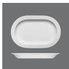
Platte oval halbtief Fahne , Platter oval half-deep with rim, Plat ovale demi-creux à l'aile, Fuente oval con ala, Piatto ovale semifondo