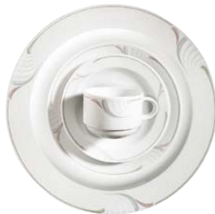
406950 Revue Lagerdekor, Stock decoration, Décoration de stock, Decorado de stock, Decoro su articoli in magazzino