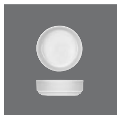
Kompottschale rund , Fruit saucer round, Compotier rond, Compotera redonda, Coppetta rotonda